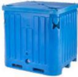
TEST STATION : Bonar Ice Chest Model PB2145